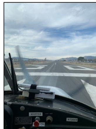
Cleared to take-off Runway 30! WHP